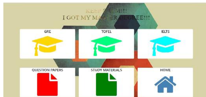
Fig 3: Higher Studies Query