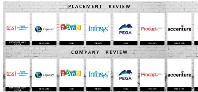
Fig 2: Placement Review