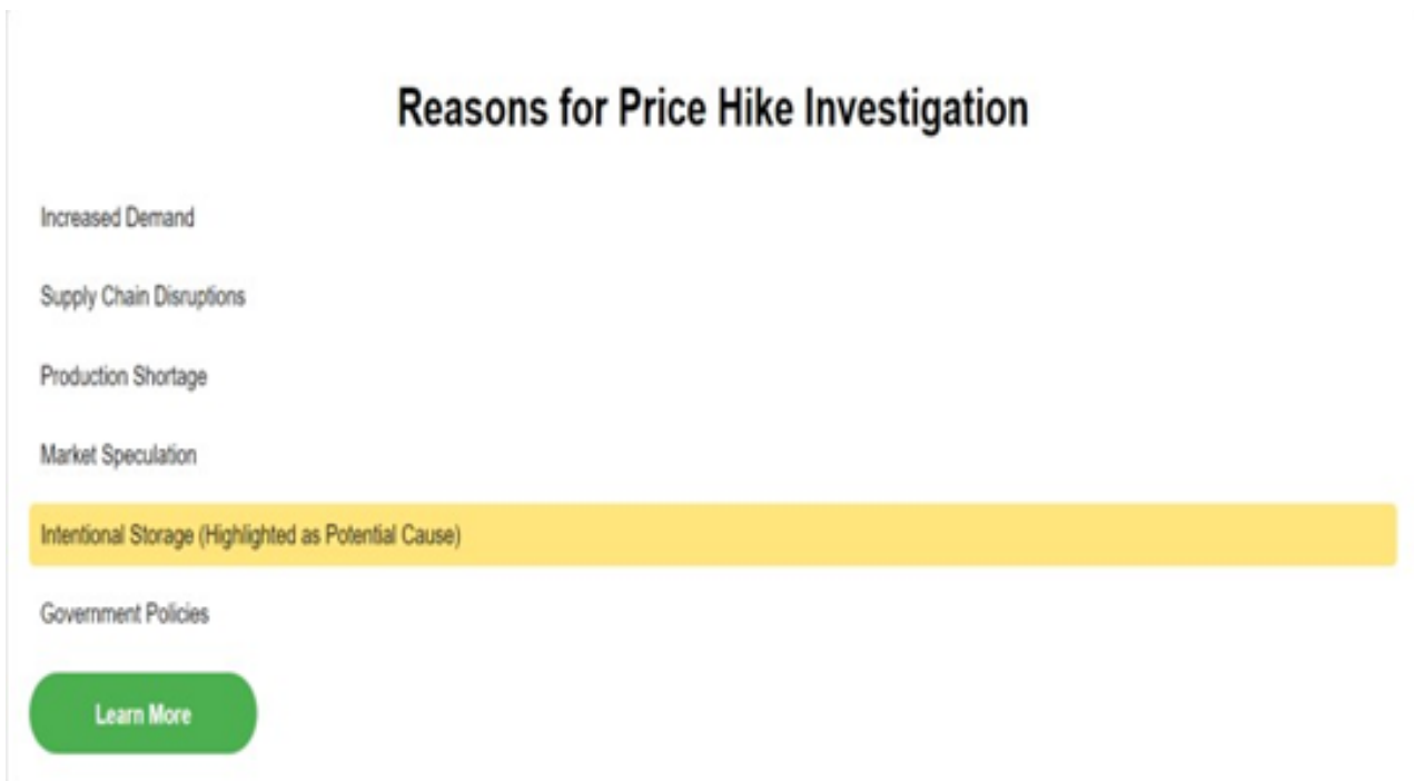
Fig 5.2 Detected results of software investigation (Frontend)