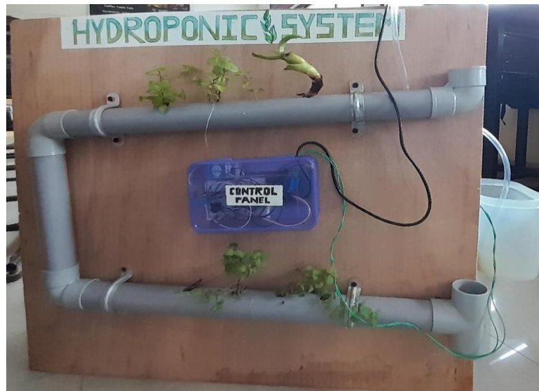
Fig.3 Hydroponic system

By leveraging cutting-edge technology and a meticulous approach to design and implementation, our project aims to revolutionize the cultivation of plants, offering a sustainable and efficient alternative to traditional farming methods.